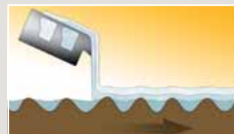
The two-layer curtain coating covers the brown base and increases brightness.