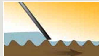
The first blade coating smooths the brown base board.

The application of coating layers within one station minimizes coating-related drying and space needs, which is especially important in rebuilds.